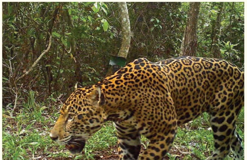
WCS uses remotely-triggered cameras and statistical procedures to estimate jaguar population sizes in South and Central America. This jaguar was photographed in Guatemala.