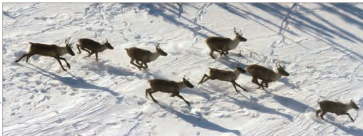
The Pagwachuan caribou range could decline due to the multiple impacts of development.