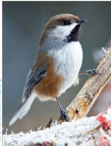
Boreal chickadees are one of the boreal forest birds that are declining in Adirondack peatlands.

Have you seen a gray jay, a boreal chickadee, or a black-backed woodpecker in the Adirondacks? The Adirondack Park is the southern range extent for several species of these rare boreal forest birds within eastern North America. Like any wildlife species at the edge of their range, they face challenges in this environment and geographic isolation from their Canadian brethren. The haunts of these boreal specialists—cool, wet, sphagnum-draped bogs and swampy woods—are thought to be particularly vulnerable to climate change, especially in the Adirondacks where they represent isolated bits of the “true boreal” to our north. Adirondack peatlands are, at the same time, deeply significant in this landscape as homes for icons like moose, loon, and marten, and are the very representation of what makes us feel like we live in a truly northern place.