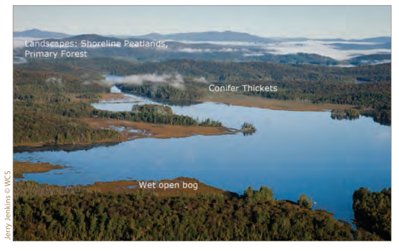
The Northern Forest Atlas will feature landscape photos taken with AirCam and annotation to illustrate the interplay of vegetation types within a landscape.

Within the Northern Forest of the northeastern United States and southeastern Canada lies a triumphant story of ecological recovery. Following a century of timber and wildlife overharvesting that nearly destroyed the region's natural resources, efforts to reverse this downward trend got traction. Today, Bicknell thrushes can be heard in the high mountains, moose are regulars in and around the 7,000 regional lakes and black bears have room to roam between habitats rich with resources. One of the largest concentrations of intact temperate forests in the world, the story of this ecosystem has yet to reach an end. Facing increasingly challenging threats, like those climate change alone poses, leveraging this initial traction toward successful ecological recovery is key if this region is going to continue to thrive into the future.