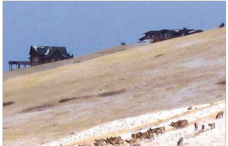
The Northern Forest Atlas will feature landscape photos taken with AirCam and annotation to illustrate the interplay of vegetation types within a landscape.

Reed and colleagues plan to take these findings another step, looking beyond the economic benefits to determine whether these unique subdivision designs achieve clear conservation benefits for a range of species.