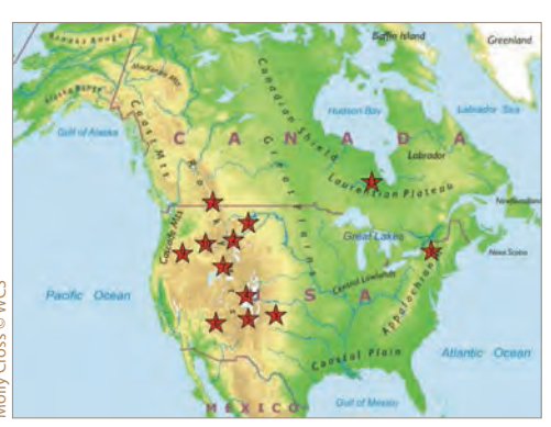
Places where the Wildlife Conservation Society and/or partners are applying the ACT Framework.

"The ACT process helps workshop participants move beyond the paralysis many feel when tackling what is a new or even intimidating topic by creating a step-by-step process for considering climate change that draws on familiar conservation planning tools," Cross said. "By combining traditional conservation planning with an assessment of climate change impacts that considers multiple future scenarios, ACT helps practitioners lay out how conservation goals and actions may need to be modified to account for climate change."