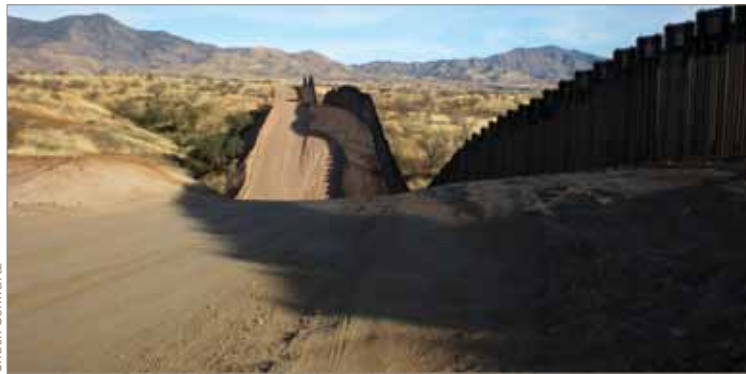
Impenetrable border fence on the United States–Mexico border.

Corridors serve many species and purposes in the border region. Recent evidence suggests that jaguars and ocelots, for example, have begun to return northward from Central America and Mexico to reoccupy their former range in the United States. Other studies indicate that a number of species cross the border when times are tough (such as in drought years) and suitable habitat exists only on “the other side.” And, our study showed that linkages across the border are essential in ensuring that bears and other species don’t become genetically isolated.