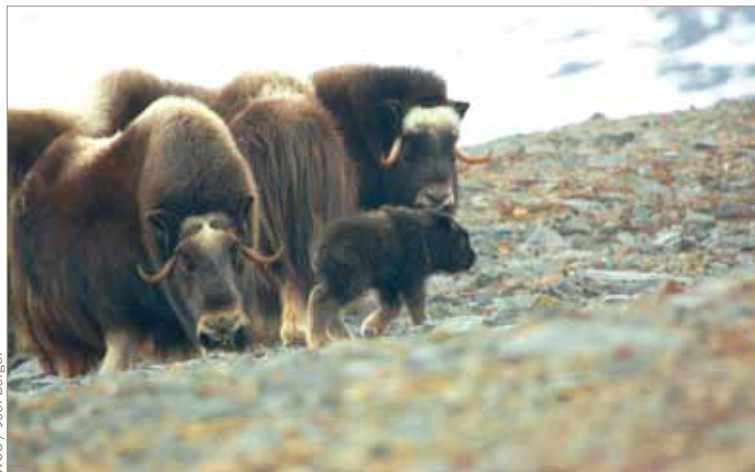
Female muskoxen with young.

WCS is committed to borderless approaches to wildlife conservation—focusing on the ecological needs of wildlife and not the political constraints of national borders. This is especially important in and around the Chukchi and Bering seas where summer sea ice is rapidly disappearing, indigenous groups continue to rely on local resources for food security, and an onslaught of new industrial activities is emerging. In an area where wildlife is shared between the United States and the Russian Federation, WCS is expanding its efforts with the new Beringia Program to actively engage in bilateral research and conservation. This will include tundra nesting birds and a suite of marine mammals as they seek refuge in a warmer and busier Arctic.