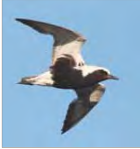
Black bellied plover in flight.

On August 14, the U.S. Secretary of the Interior Ken Salazar announced a proposed plan for the National Petroleum Reserve-Alaska (NPR-A) that balances conservation and energy development and protects critical indigenous hunting areas in one of Arctic Alaska's most important landscapes for wildlife.