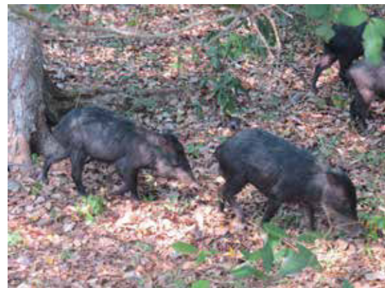
Figure 1c. White-lipped peccary showing skin hairless area in the Maya Biosphere Reserve on June 3rd 2013.