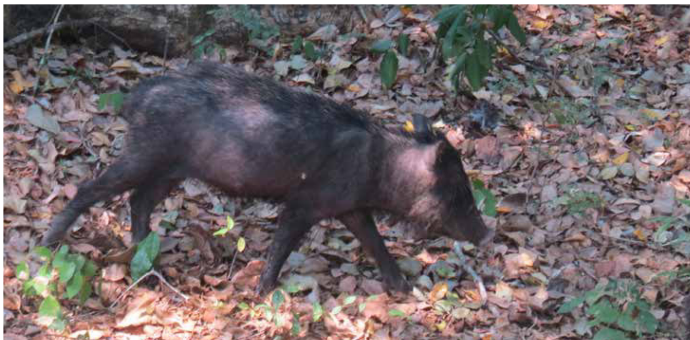
Figure 2. Photo of the same White-lipped peccary of figure 1d in Calakmul Biosphere Reserve with hairless skin areas.