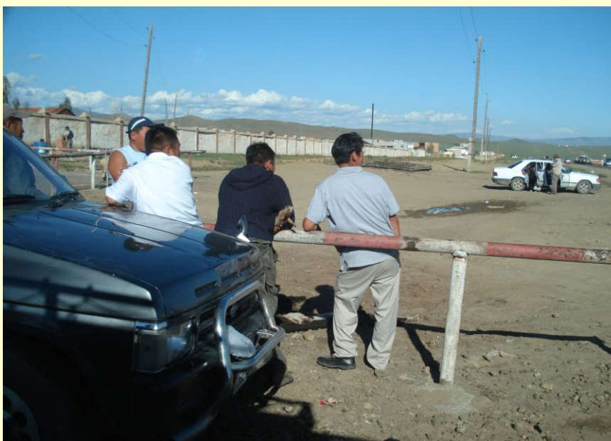
Marmot traders waiting for buyers just outside Tsaiz market

Located to the east of Ulaanbaatar, Tsaiz market is a former military barracks converted into a major raw materials collection point for the three eastern aimags. Tsaiz is smaller than Emeelt, perhaps due to the fact that it only serves a smaller area (three eastern aimags), and the fact that the eastern aimags have direct border crossing points with China (making it unnecessary for hunters and traders to come to Ulaanbaatar to find a buyer for wildlife products). About 6% of the WCS student survey observations of wildlife trade were made in the Tsaiz market.