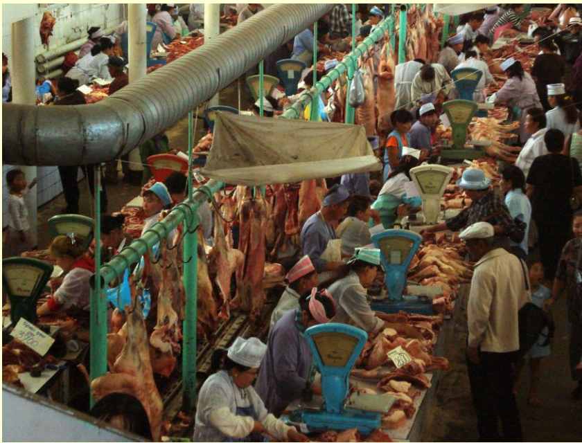
Meat sellers at Bayanzurkh market

observations of the wildlife trade in the Bayanzurkh market. Here, the market inspections are limited to police (for keeping the peace, investigating petty crimes) and the market administration office itself, both located in a building near the main entrance to the market, just off Peace Avenue. The market administration represents the market owner. A small team of accountants collect rental fees and income taxes from each seller in the market; the aggregated taxes are then turned over to the municipal