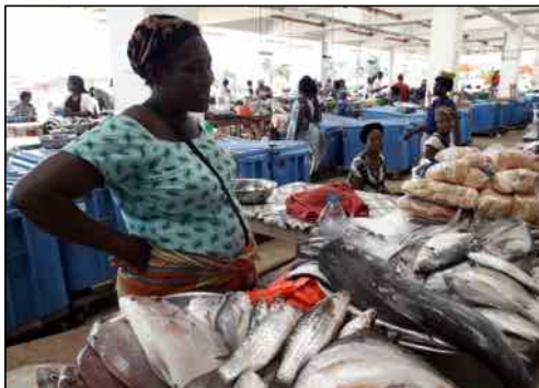
Visit to the Artisanal Fisheries Support Center in Libreville (CAPAL) during the Congo / Gabon exchange mission.