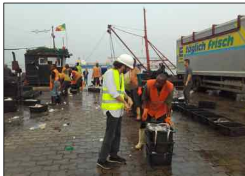
Visit to the industrial fisheries landing site in Pointe Noire to improve catch monitoring..