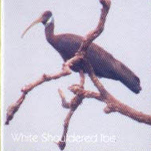
White Shouldered Ibis

The rice is certified as Wildlife-Friendly™, a new global product brand registered in the USA by the Wildlife Friendly Enterprise Network, a global organization dedicated to the development and marketing of products that conserve threatened wildlife while contributing to the economic vitality of rural communities ( wildlifefriendly.org ).