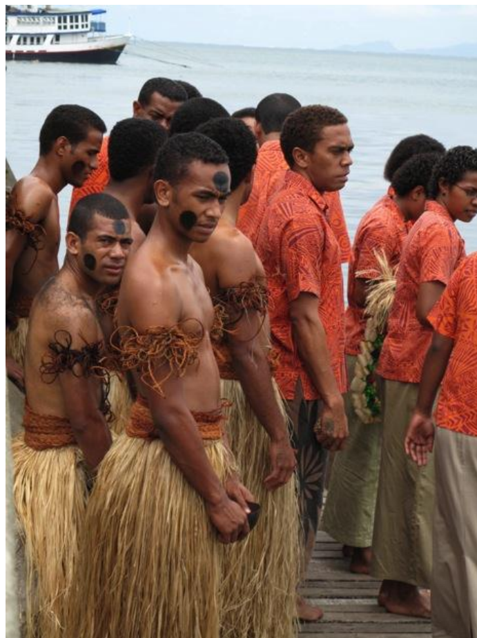
Fijian youth in traditional attire, Suva, Fiji.

Over the past two decades, several hundred coastal communities in Fiji have established locally managed marine areas (LMMAs) (Govan et al. 2009a; Mills et al. 2011) and share knowledge about best practice through the Fiji LMMA network (FLMMA). While the primary management tool applied within LMMAs has been customary fishing closures, communities are now scaling up management activities to include adjacent freshwater and terrestrial areas within clan, village or district tenure boundaries (Clarke and Jupiter 2010). There has been recent dialogue among stakeholders in Fiji to develop parallel learning networks to FLMMA to help communities share best practice for sustainable land management and climate change adaptation.