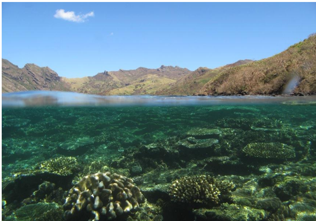
A ridge to reef seascape from Waya Island, Fji.

While most land is held under customary landownership, marine and freshwater tenure is vested in the State by virtue of the Crown/State Land Act [Cap 132] and the Rivers and Streams Act [Cap 136] . This is a contradiction to traditional customary law where traditional fishing grounds ‘iqoliqoli’ belonged to adjacent communities (see section 1.2 above).