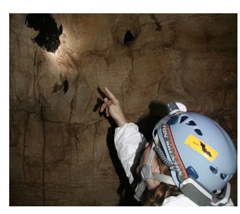
Bat ecologist counts bats

be a partial barrier to bat movement. If bat-to-bat transfer remains the mode of spread for this fungus, and humans take precautions to not spread the fungus, the west could remain WNS free for many years. Preventing a giant leap of the P.d. fungus is the most important thing humans can do for western bats.