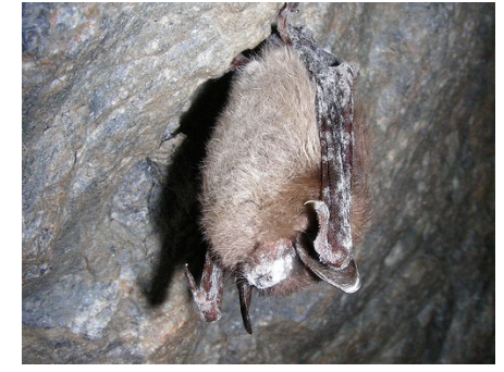
WNS infected bat in Eastern USA

Hibernating bats are most at risk to WNS disease. Bats that migrate (e.g. hoary bat) can travel hundreds and even thousands of kilometers, while hibernating bats do not tend to travel long distances between summer and winter roosts. There is a significant difference in bat diversity on the east and west side of the Rocky Mountains, suggesting this may