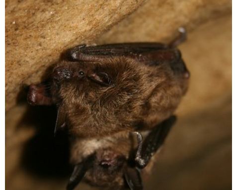
Healthy little brown bats

Email: Purnima.Govindarajulu@gov.bc.ca Phone: 250 387 9755