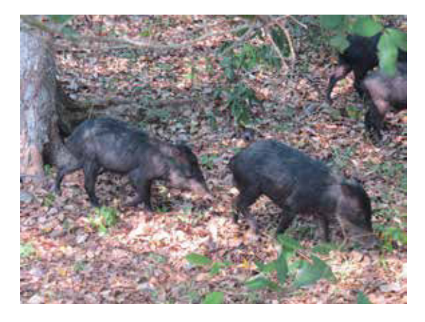
Figure 1c. White-lipped peccary showing skin hairless area in the Maya Biosphere Reserve on June 3rd 2013.