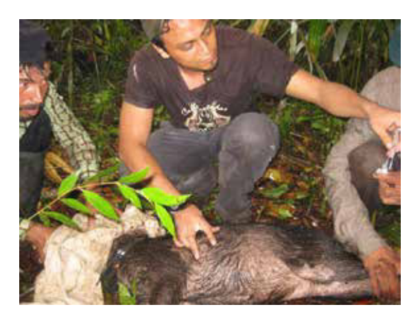
Figure 1b. White-lipped peccary skin problem in Nuevo

Figure 1a. White-lipped peccary in Mirador-Río Azul National Park within the Maya Biosphere Reserve on May 5th Becal, Calakmul, Campeche on June 18th 2011. Photo: 2007. Photo: José Moreira-Ramírez, Wildlife Conservation Marcos Briceño-Mendez, El Colegio de la Frontera Sur. Society - Guatemala Program.