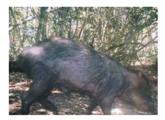
Figure 1a. White-lipped peccary in Mirador-Río Azul National Park within the Maya Biosphere Reserve on May 5th Becal, Calakmul, Campeche on June 18th 2011. Photo: 2007. Photo: José Moreira-Ramírez, Wildlife Conservation Marcos Briceño-Mendez, El Colegio de la Frontera Sur. Society - Guatemala Program.